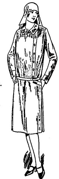
THE "AVIS." Nurse's Overall Dress with detachable buttons inverted pleats at sides. The new inset pockets. Pique and Drill, 12/11 Poplin, 15/11 and 18/11 Tricoline, 21/9.

APRON CLOTH G. P. linen-finished. Highly recommended. 52 in., yard 1/6 1 / 2 . The "DORIS" ditto, 54 in., yard 1/11. The "PORTLAND," ditto, 54 in., yard 2/3 1 / 4 .